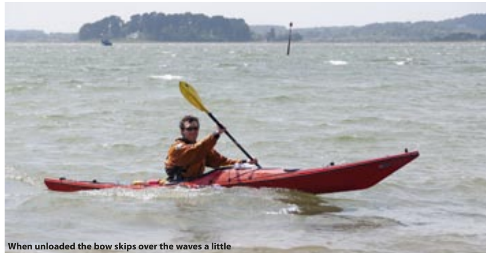
When unloaded the bow skips over the waves a little

As you would expect from such a playful sea kayak the Zegul 520 surfs beautifully, and never feels unwieldy or out of control, although be prepared to paddle aggressively, the rocker and bow position when the boat isn't loaded make it quite easy to get turned around and surfed backwards if you don't dominate it. We think that in the right hands this boat could really be put through its paces in the surf or on a substantial tide race. It's an absolute dream to roll, so you'll never feel uncomfortable pushing yourself for fear of not being able to bring it back up again. If you're a sea paddling thrill seeker out for a bit of fun on a day with good conditions the design of this boat is guaranteed to give you a fine ride and put a smile on your face!