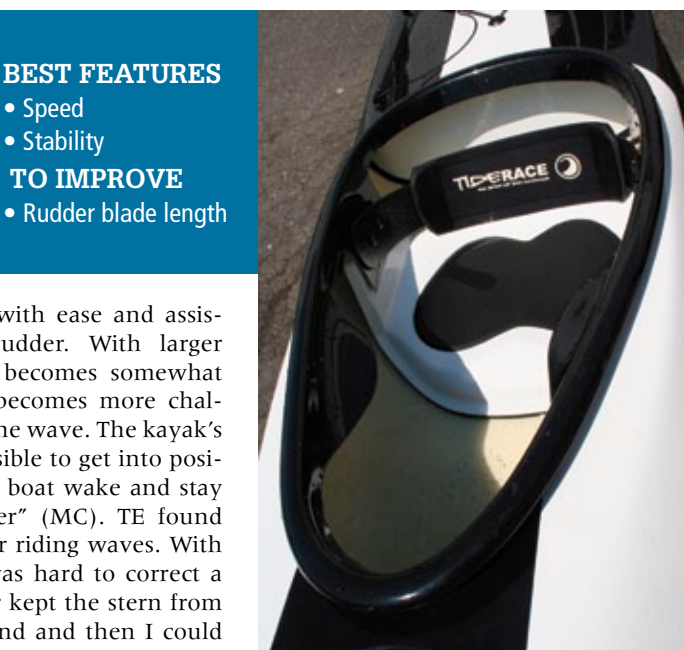
The layout of the cockpit is simple and effective.

deck day compartment have hatch covers that are "very easy to use-some of the quickest to operate I have encountered-and provided an excellent seal. There were no leaks" (MC). TE also reported "all compartments remained bone dry after rolling." The translucent composite bulkheads are sealed with caulk.