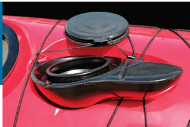
The foredeck storage pod, shown here partially out of its recess, can be removed so small valuable items can be easily carried ashore.

to get the boat to leecock but it did stiffen the tracking so I’d set a downwind course and then lower the skeg. While surfing wind waves the Etain tended to wander a bit on takeoff, but had good speed for catching waves and holding rides” (TE). “It feels quite quick to accelerate, and very easy to manage when beginning to broach” (MK).